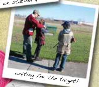
waiting for the target!

"Whether I'm coaching or competing, White Flyer's high standards give me the confidence I need so that I can concentrate on my shooting. Consistency and breakability are why White Flyer Targets are my choice!"