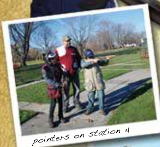
pointers on station 4

With a duo of Nora Ross and White Flyer targets you're sure to get that "quality time" with family and friends. Watch those 25 reasons turn into 100!